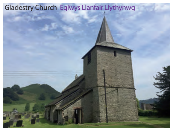
Gladestry Church Eglwys Llanfair Llythynwg

In February we had the thrill of undertaking a piece of work associated with the Cwm Elan Lead Mine, Powys. The Elan Valley Estate have rebuilt the former mine smithy to create an interpretation station for walkers. It was remarkable to see an upland industrial site ring out to the sounds of industry once again!