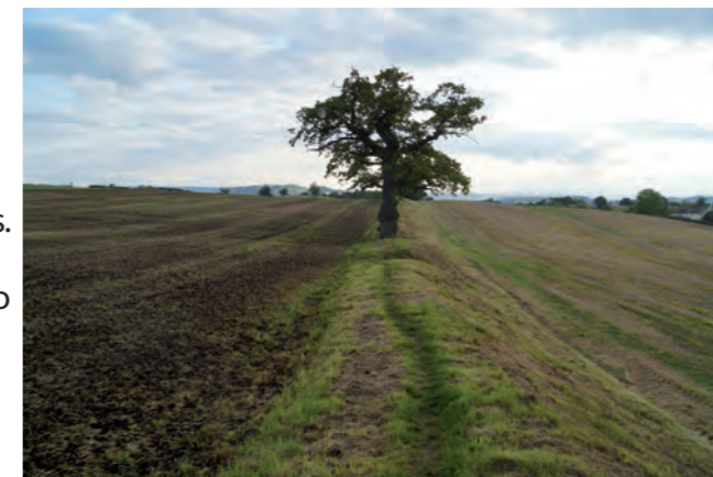
Clawdd Offa, Ffordun, Powys

Nadolig Llawn a Blwyddyn Newydd Dda i bawb! Wrth i ni nesu at ein 14eg blwyddyn fel partneriaeth, rydym yn dal i gael ein synnu gyda'r ffordd mae byd archaeoleg yn newid o'n cwmpas. Rhaid addasu trwy'r amser er mwyn cadw lan! Blwyddyn arall o newidiadau oedd 2017, gydag elfennau o Ddeddf y Dirwedd Hanesyddol yng Nghymru yn dod i rym. Dyma newid hanesyddol hynod bwysig i ni fel cenedl, sydd rhywsut wedi osgoi penawdau llawn storiâu am Gylchoedd Haearn, Llafn y Cewri a dreigiau sy'n anadlu mwg a than!