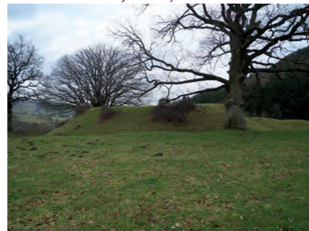
Castell Sycharth Sycharth Castle

Cofnodi beddfeini. Mae rhaglen adnewyddu ar Eglwys St. Barnabas, Drefach Felindre, Sir Gaerfyrddin wedi cael ei hariannu gan Gronfa Treftadaeth y Loteri. Fel rhan o'r prosiect, rydym wedi gwneud arolwg o'r fynwent sy'n cynnwys tynnu llun o bob carreg fedd a chofnodi eu lleoliad. er mwyn creu cynllun cywir o'r beddau. Mae swyddogion yr eglwys wedi bod wrthi yn trawsgrifio cofrestr y plwyf, gyda'r holl wybodaeth yn cael ei fwydo mewn i fâs-data, i ffurfio adnodd defnyddiol i'r dyfodol.