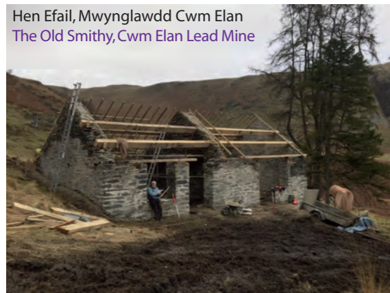
Hen Efail, Mwynglawdd Cwm Elan The Old Smithy, Cwm Elan Lead Mine

We spent four days on a watching brief at Forden, Powys in September, watching a massive new slurry pit being built. Little of interest appeared until the end of the fourth day when a single pit packed with burnt stone and charcoal was revealed. Radiocarbon date - Middle Bronze Age.