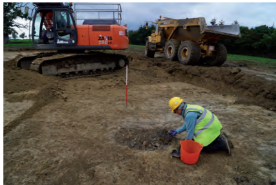
Fferm y Gaer, Ffordun, Powys Gaer Farm, Forden, Powys

We have kept in touch with the Pendinas Project, Penparcau, Ceredigion throughout the year. In April we were on Pendinas hillfort with our friends from Archaeology Wales (left) who were carrying out a geophysical survey on the fort. We also played our part in a community day in Penparcau where the results of the survey were revealed, the most important discovery being the confirmation that there is a Bronze Age cairn within the Iron Age hillfort.