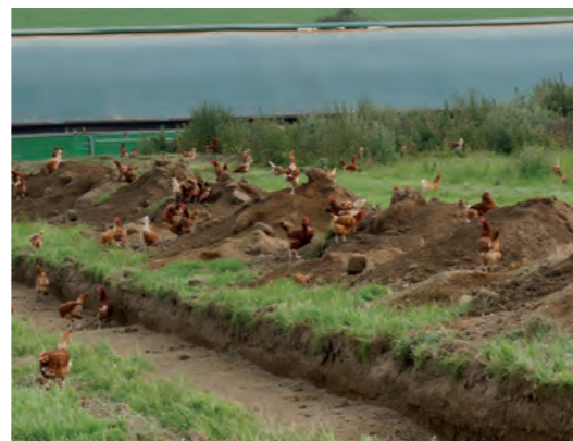
Geir Fferm y Bâch, Maesyfed Newydd, Powys yn helpu gyda'r cloddio! The resident hens at Bache Farm, Forden, Powys help with the digging!