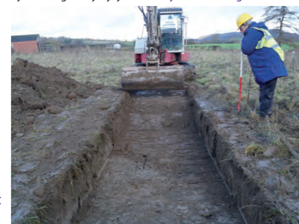
Ydych chi'n gweld ymyl y ffos? Can you see the edge of the ditch?