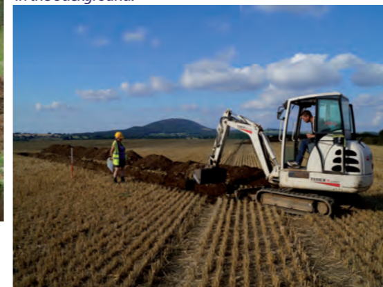
Fferm Belswardyne, Cressage, Sir Amwythig, gyda'r Wrekin yn y cefndir. Belswardyne Farm, Cressage, Shropshire, with the Wrekin hill in the background.

Ym Mis Gorffennaf gawsom y profiad diddorol o wneud arolwg o Gapel Annibynnol Brynteg, Gorseinon, Abertawe. Mae'r achos yno wedi dod i ben bellach a'r adeilad ar fin cael ei droi'n fflatiau. Gwaith ni oedd cofnodi'r adeilad, tu fewn a tu fâs, mewn cyfres o luniau. Dyma'r capel a'r pulpud lle pregethodd Evan Roberts ar y 10fed o Fis Tachwedd, 1904 - y noson daeth ei Diwygiad Mawr i sylw'r wasg a'r byd mawr.