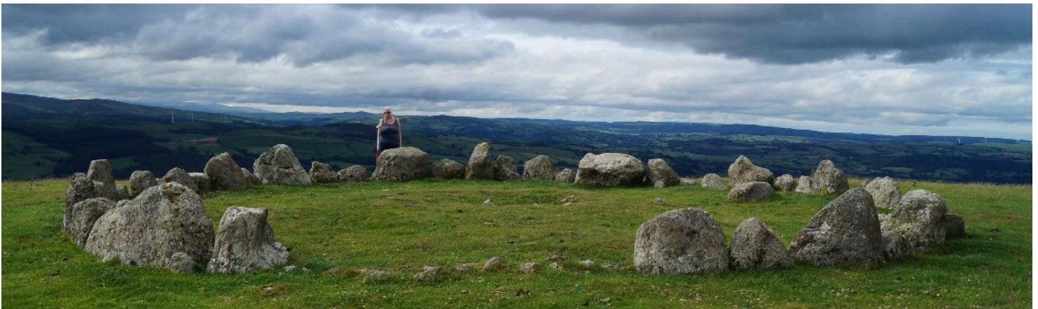
Ymweliad â Chylch Cerrig, Moel Ty Uchaf, Llandrillo, Sir Ddinbych, Mis Medi. A visit to the Moel Ty Uchaf Stone Circle, Llandrillo, Denbighshire, September.

Despite the long months of lockdown, we managed to get around a bit later in the year. The range of these projects was surprising in distribution and variety, despite the circumstances. We feel lucky to have kept busy during these difficult times. Overleaf are just a few of this year's highlights!