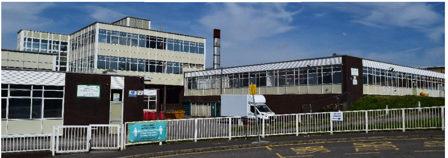
Dros yr haf fe wnaethon ni gofnod adeilad gwirfoddol o Ysgol Uwchradd Cefn Saeson, Cimla, Castell Nedd cyn iddi gael ei dymchwel. This summer we made a voluntary building recording of Cefn Saeson Comprehensive School, Cimla, Neath before demolition.